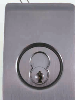
Small Format IC 6 or 7 pin