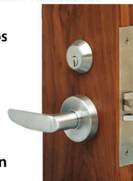
Half Curved Lever Sectional Trim