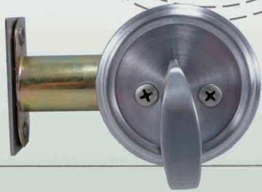
2" ADA Approved Thumb Turn with 1/8" Steel Mounting Plate