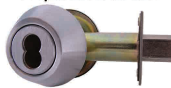
D1-S-IC Single Cylinder D1-D-IC Double Cylinder