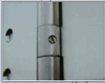
BB5-NRP Non Removable Pin